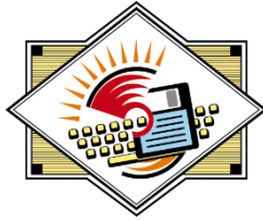
Business, Management Marketing & Technology