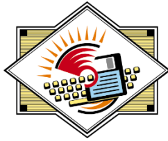
Business, Management Marketing & Technology